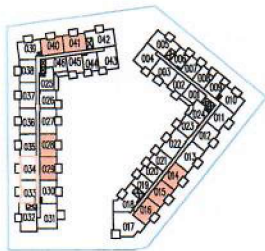
⊗ 2nd-4th floor plate